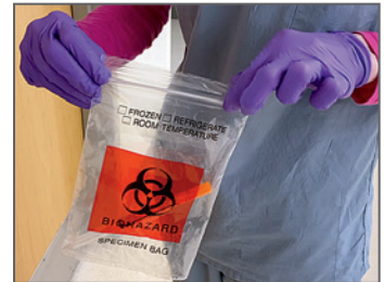
Figure 4. Handling the Nasopharyngeal Swab Specimen.

Shown is the swab in a collection tube placed in a biohazard bag.