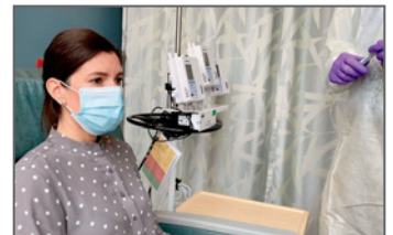
Figure 2. Patient Wearing a Mask.

The clinician is shown wearing the PPE required during collection of a nasopharyngeal swab specimen.